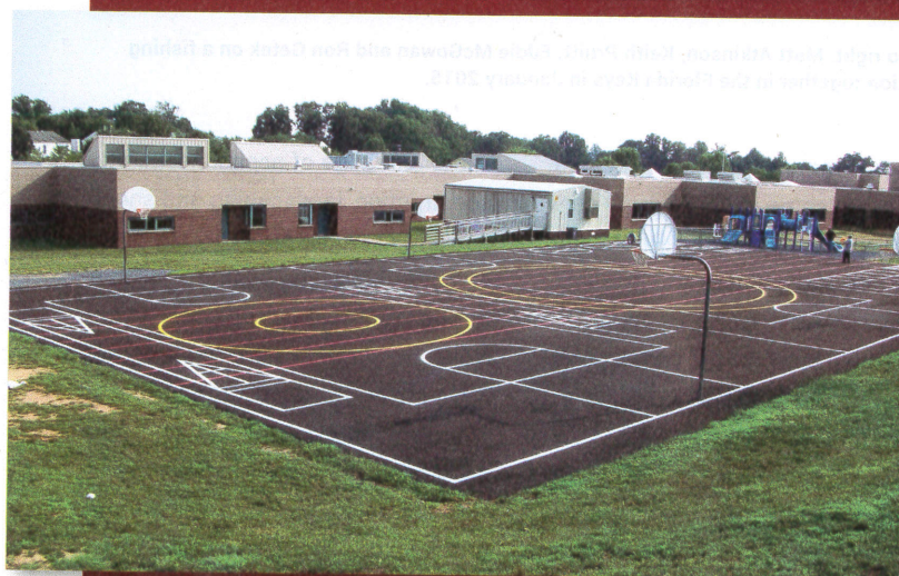
Before and after photos of an elementary school recreational court in Montgomery County, Maryland, which was upgraded by GMC Contractors Inc.