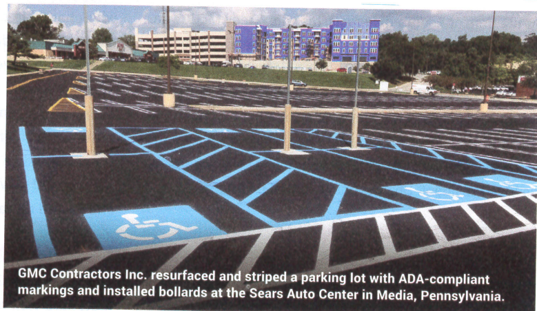
GMC Contractors Inc. resurfaced and striped a parking lot with ADA-compliant markings and installed bollards at the Sears Auto Center in Media, Pennsylvania.