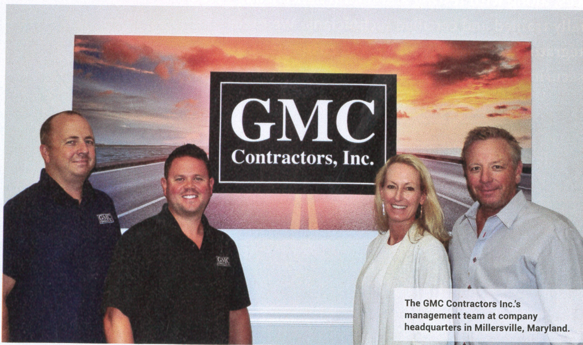
The GMC Contractors Inc.'s management team at company headquarters in Millersville, Maryland.